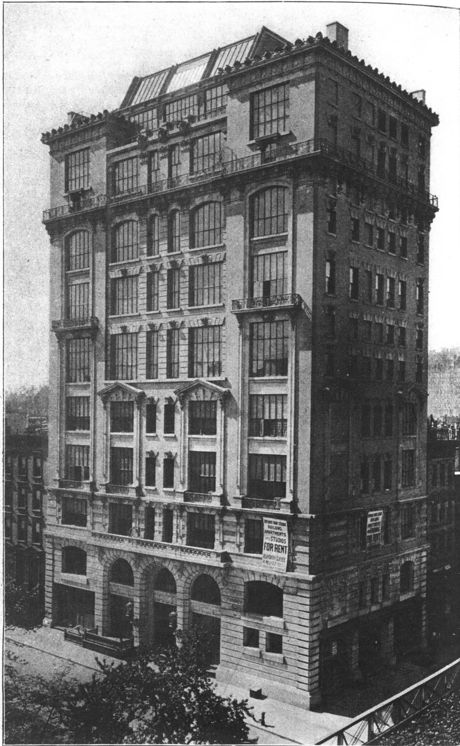
A. J. Robinson Company, Builders.