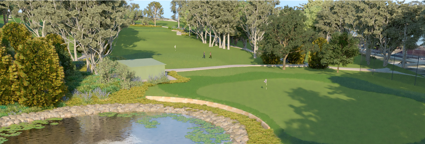
Artist impression of reconfigured Cammeray golf course 6th hole. Landscape shown at full maturity.

*Please note: one vehicle entering and then exiting the site is counted as two movements