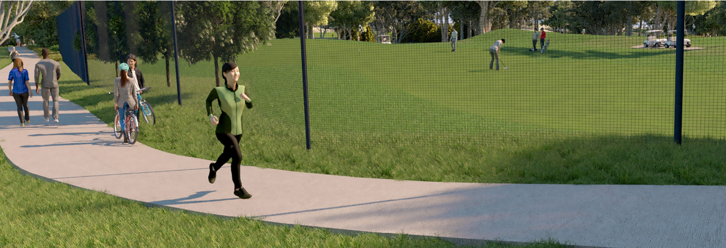
Artist impression of new shared path around Cammeray golf course.