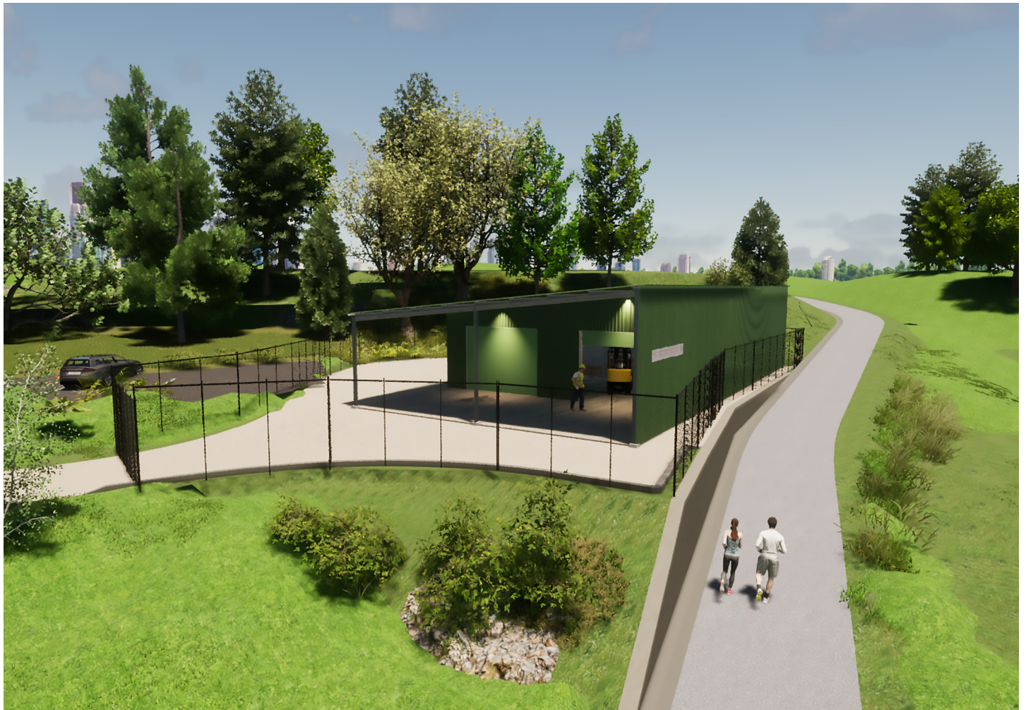
Artist's impression of the shed next to the new temporary shared user path looking south.

Temporary storage containers may be located within the golf course car park during construction.