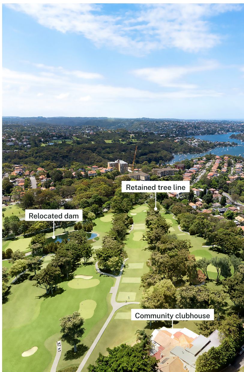
Artist impression of reconfigured Cammeray golf course looking north east. Landscape shown at full maturity.

Visit the project portal at nswroads.work/wfuportal to view animations, artist impressions and a recording of the Cammeray golf course online information session to learn more.