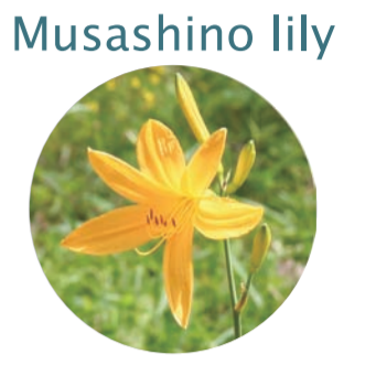
Musashino lily A yellow lily that grows only in the Sengen Hill Park. Blooms in April and May.