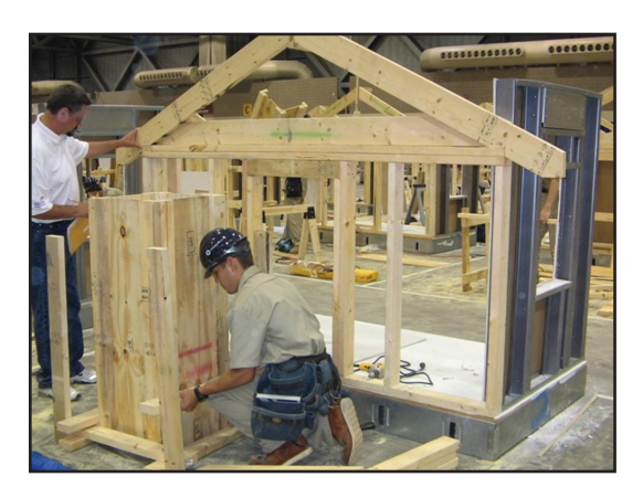
NIOS students in one of a Vocational (Carpentry) Training Programme.

NIOS offers some subjects as Life Enrichment Courses viz., Paripurna Mahila (Women Empowerment), Yog, and Hindustani Music etc. These courses are meant for self development and enrichment of knowledge. No examination is conducted for these courses. Some of these courses are also available as Certificate Courses in which the examination is conducted.