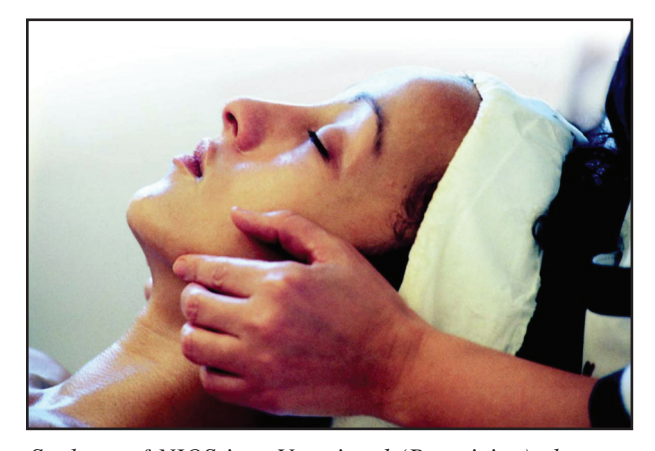
Students of NIOS in a Vocational (Beautician) class.