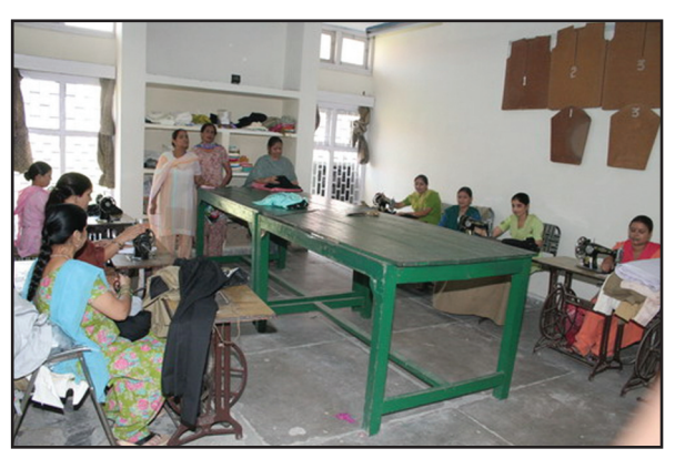
Students of NIOS in a Vocational (Cutting & Tailoring) class.